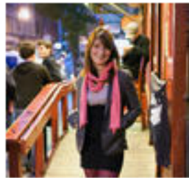
CMJ Street Fashion