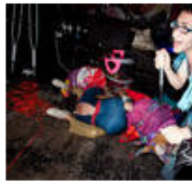
CMJ 2009 in Photos