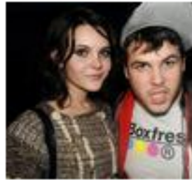
Roxy's Playhouse (NSFW)